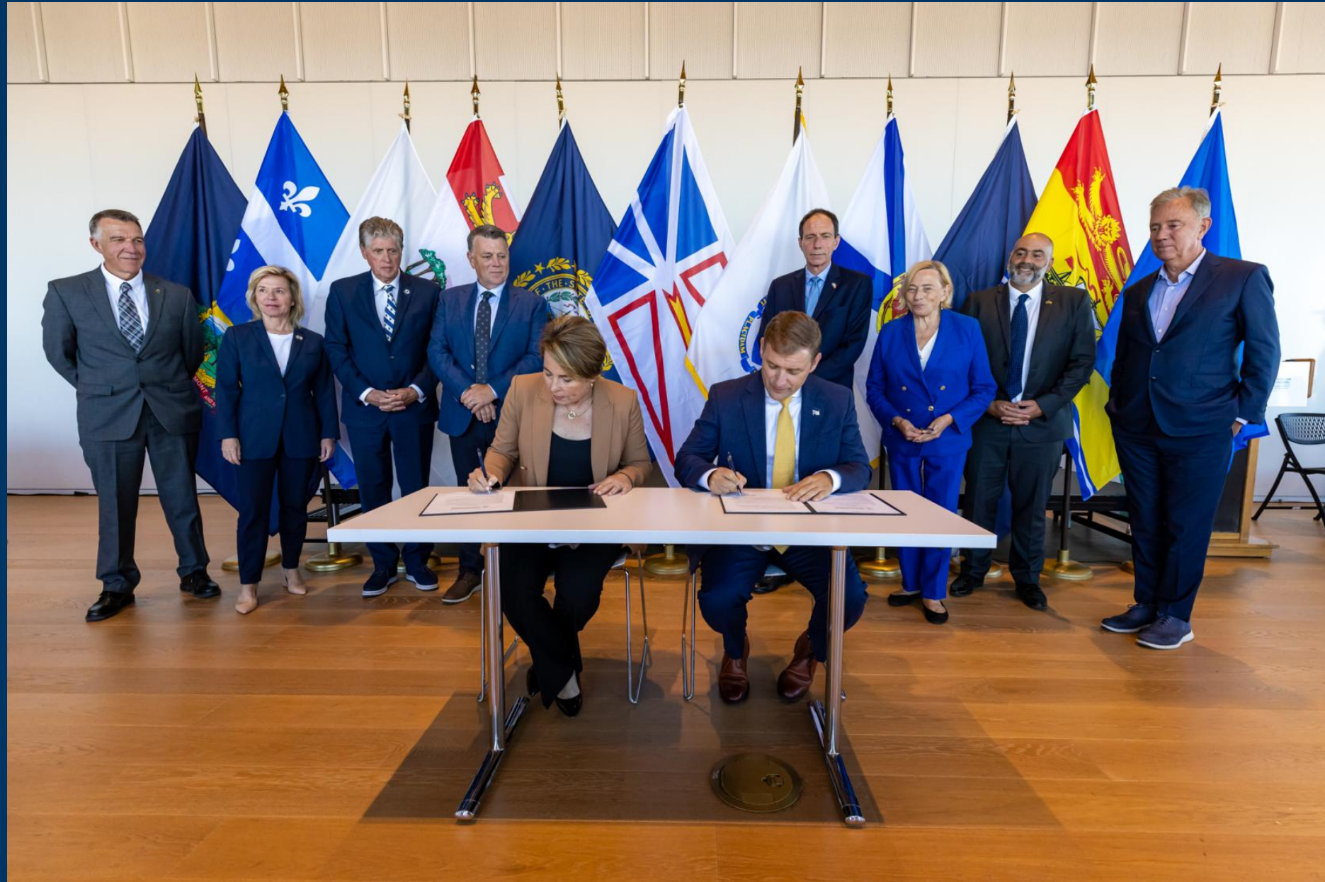
NEG-ECP Conference in Boston, 9/25/24